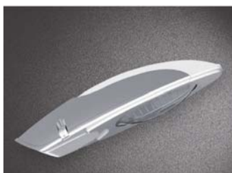
Type A. 36W LED