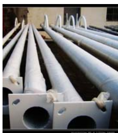
Steel pole + Brackets + 14m cable and accessories