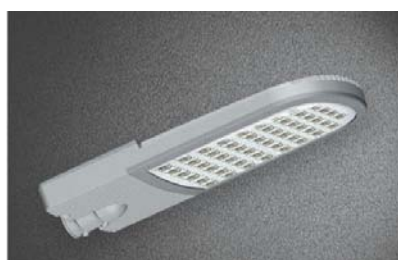
TYPE. B 21W LED